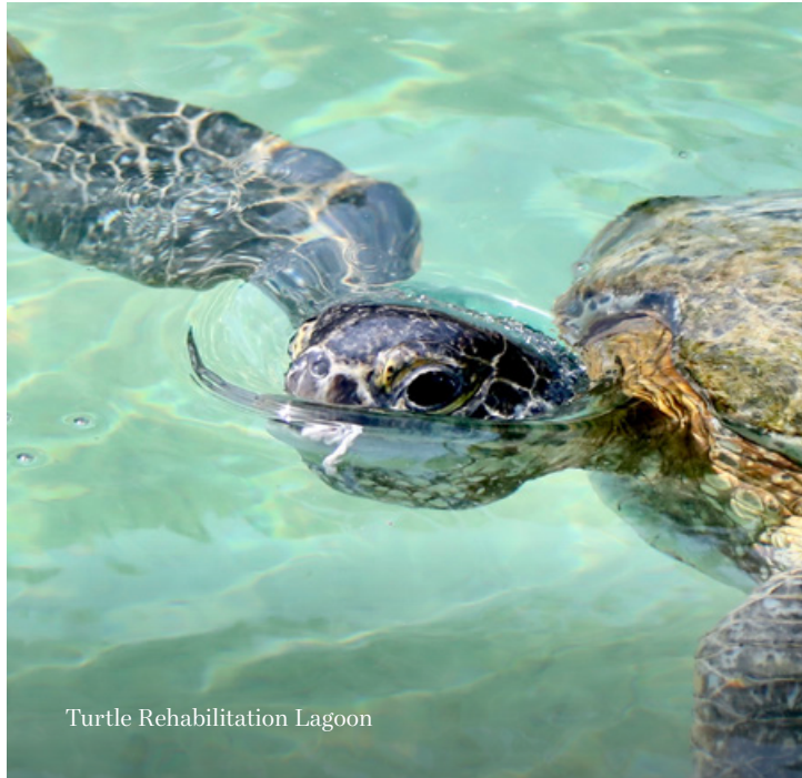
Turtle Rehabilitation Lagoon