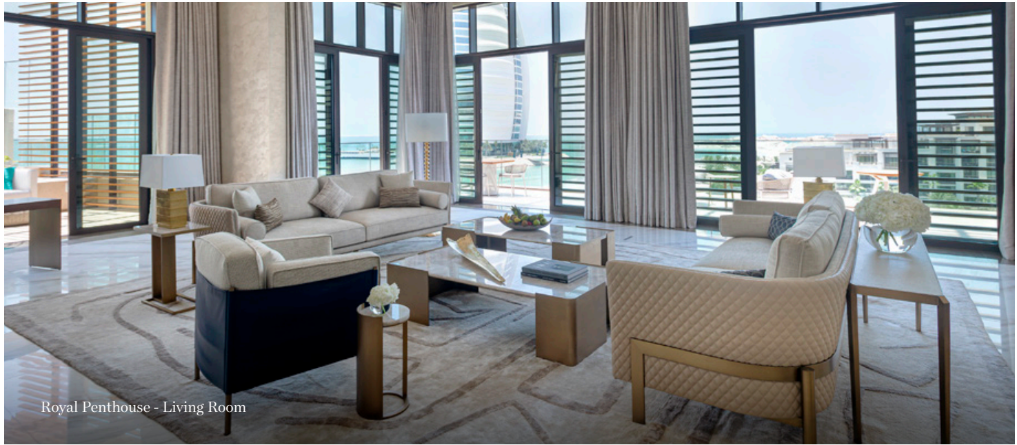
Royal Penthouse - Living Room