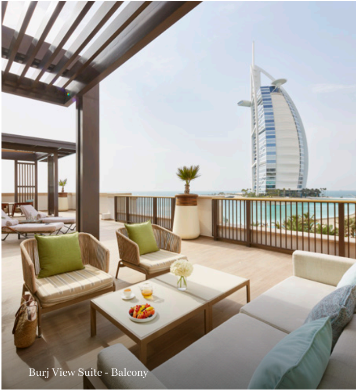
Burj View Suite - Balcony