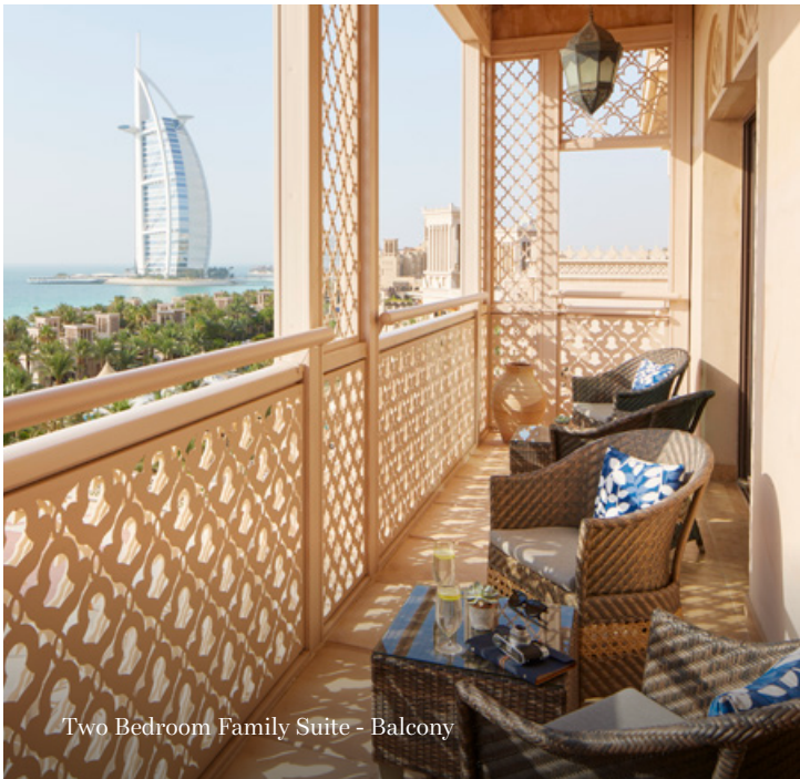
Two Bedroom Family Suite - Balcony