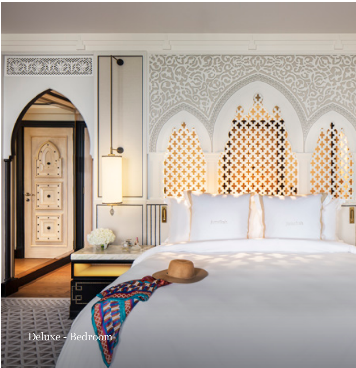
Deluxe - Bedroom