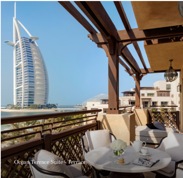
Ocean Terrace Suite - Terrace