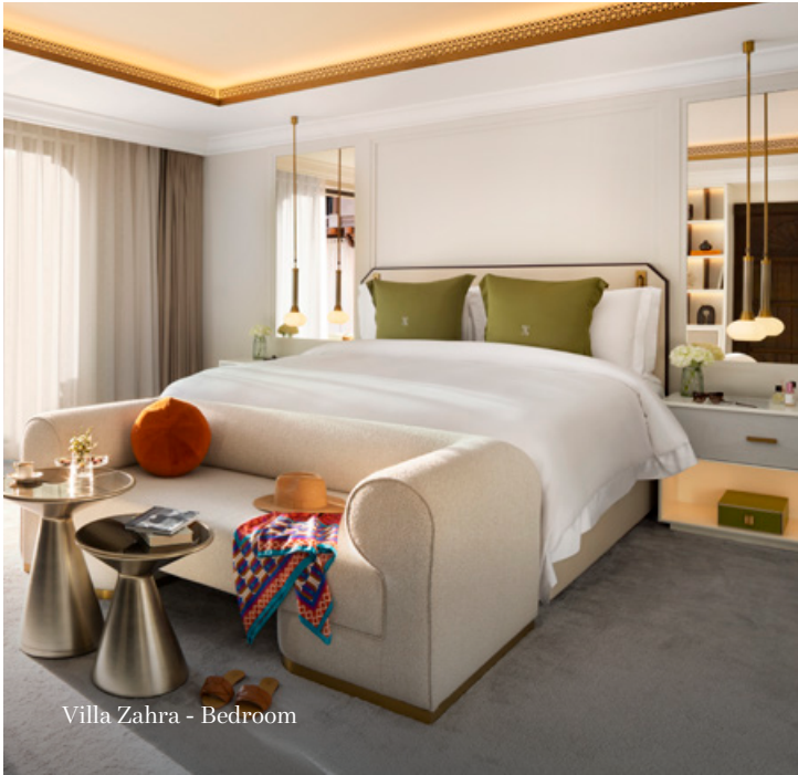
Villa Zahra - Bedroom