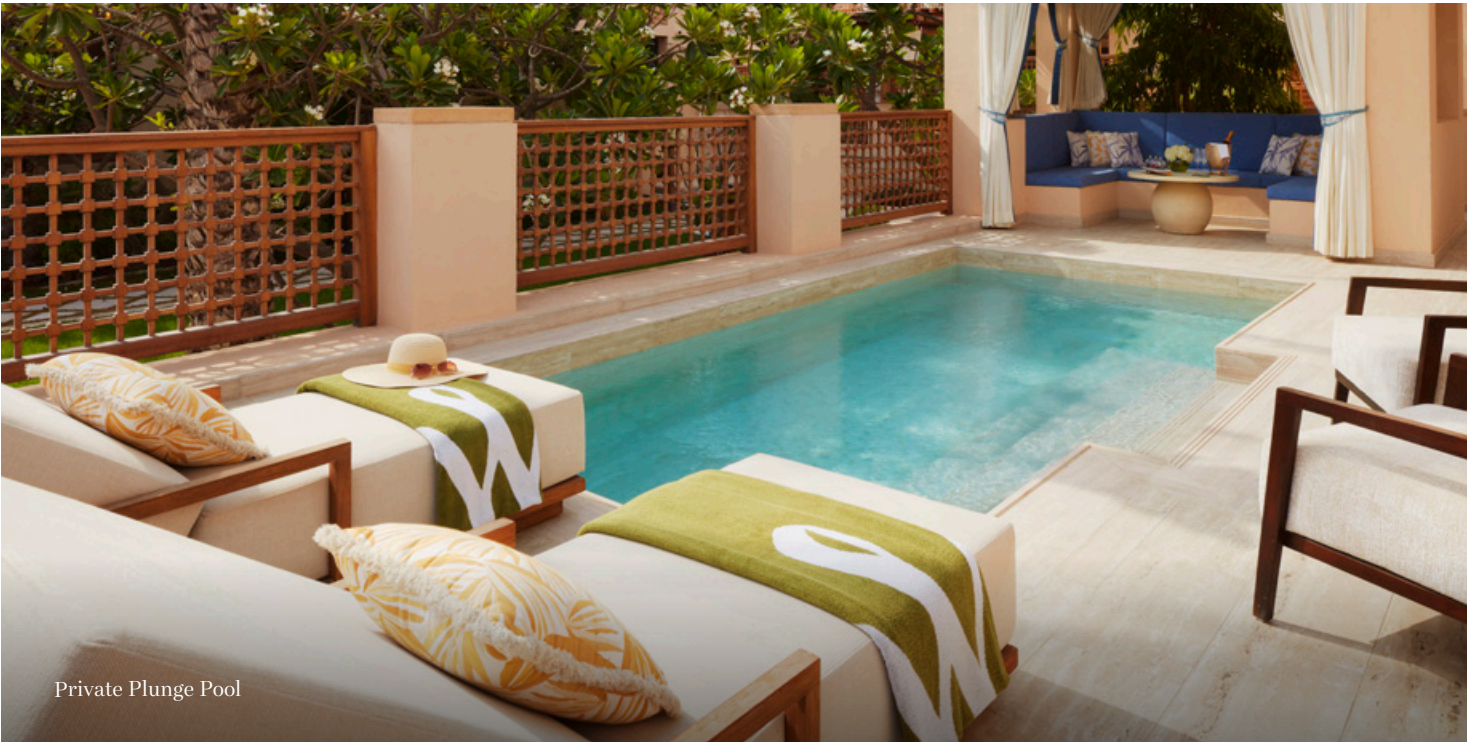
Private Plunge Pool