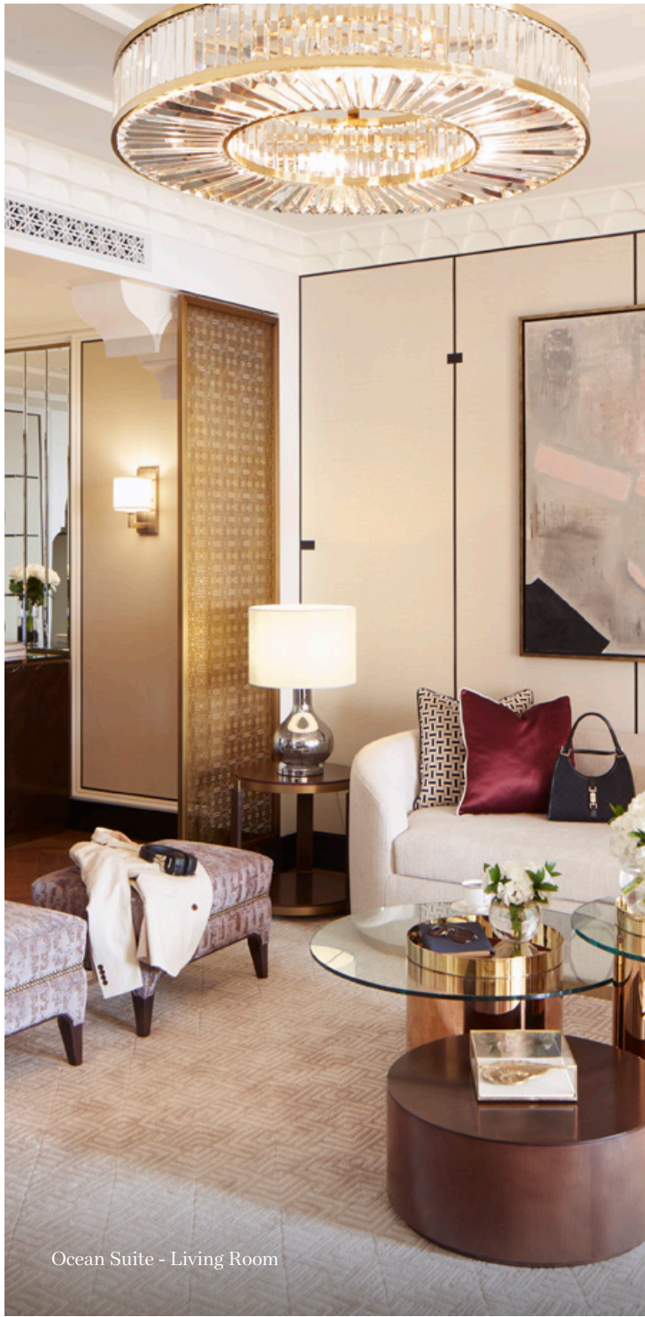
Ocean Suite - Living Room