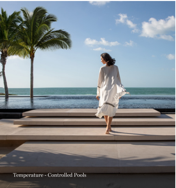
Temperature - Controlled Pools