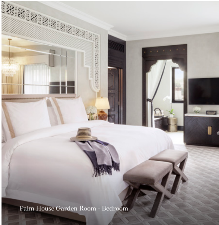
Palm House Garden Room - Bedroom