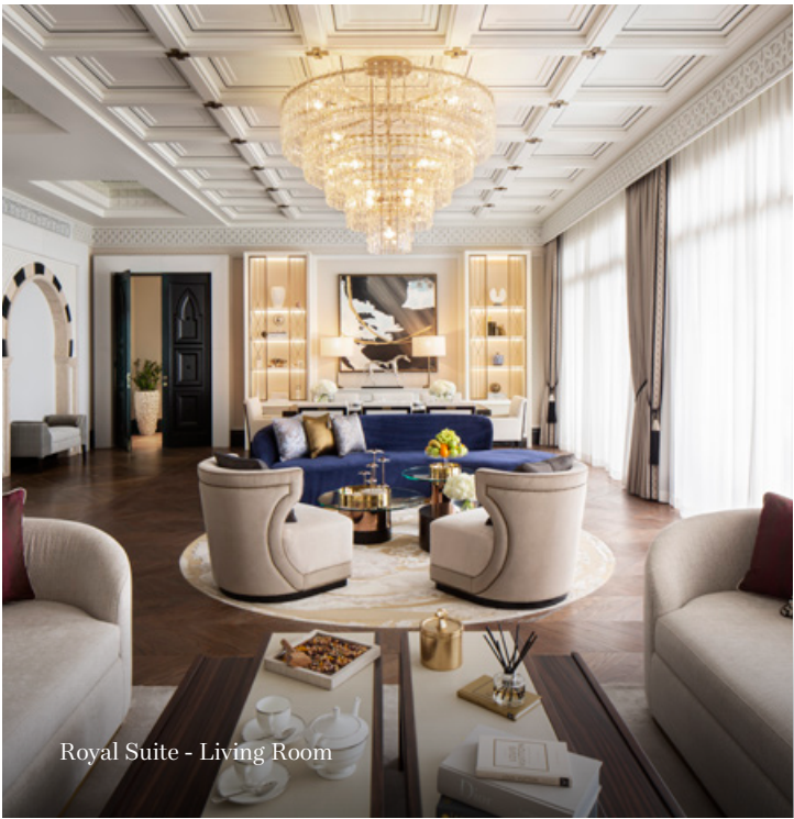
Royal Suite - Living Room