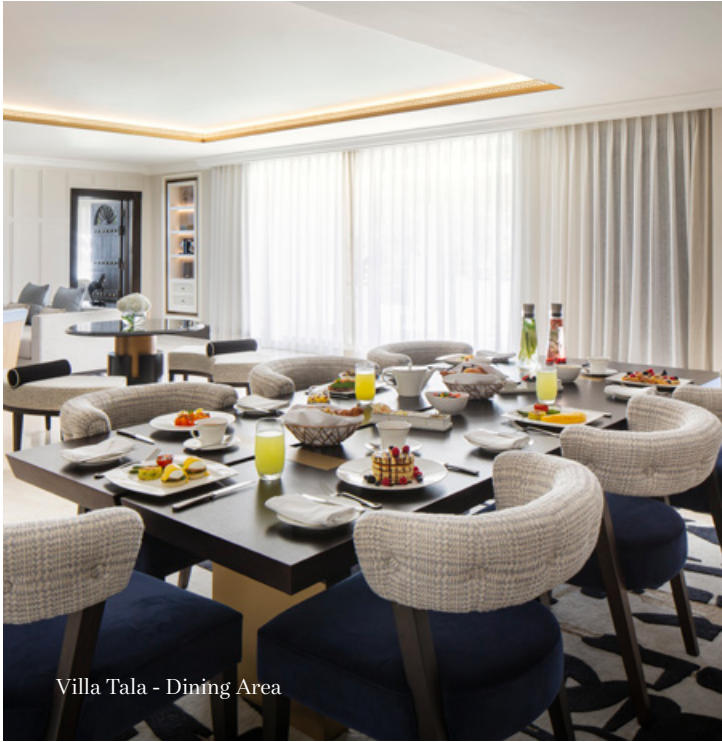
Villa Tala - Dining Area