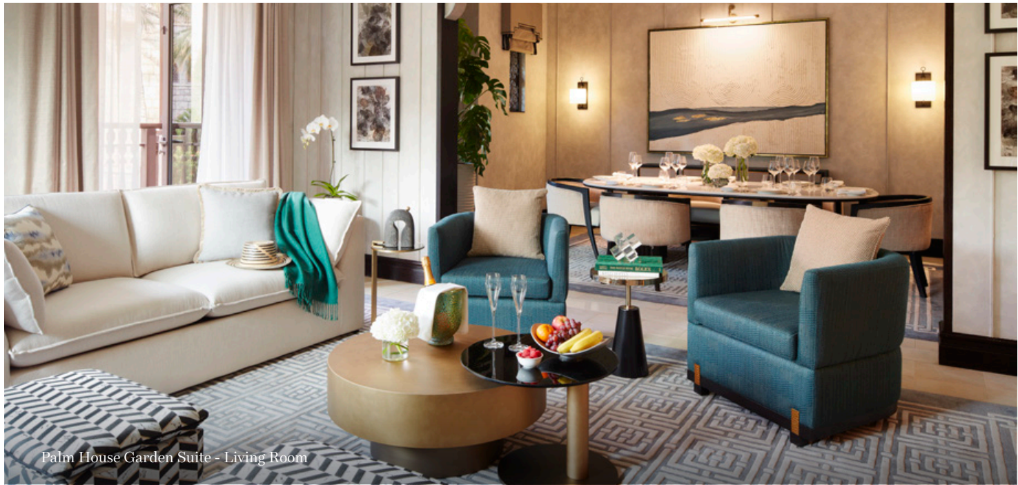
Palm House Garden Suite - Living Room