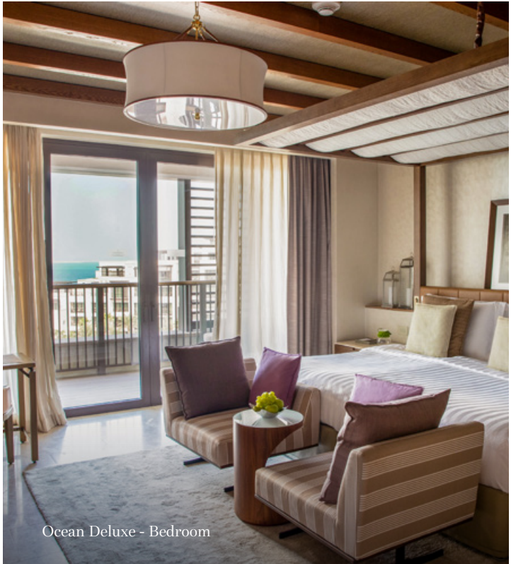
Ocean Deluxe - Bedroom