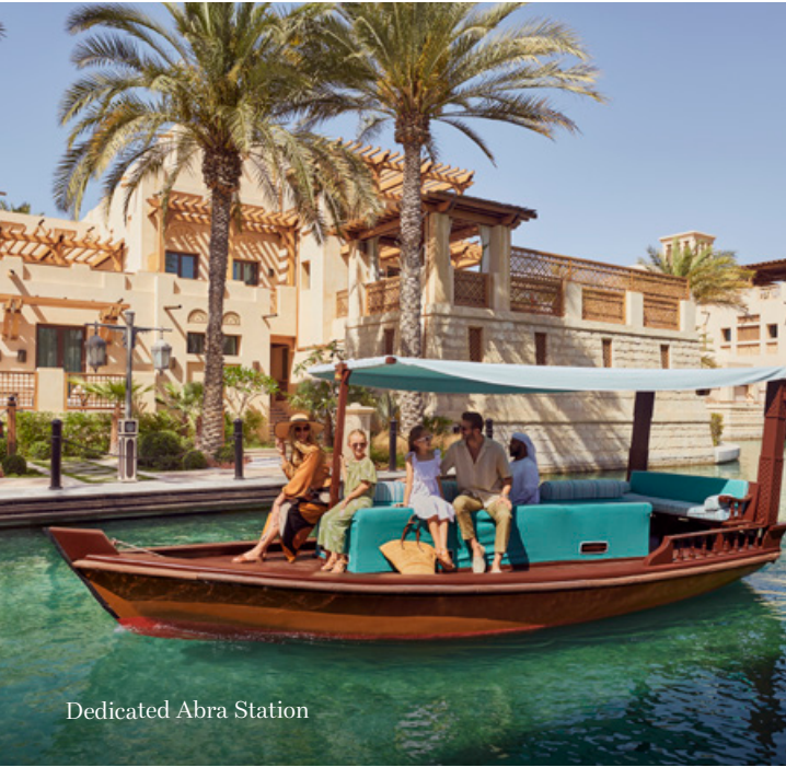
Dedicated Abra Station