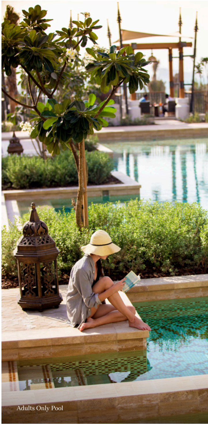
Adults Only Pool