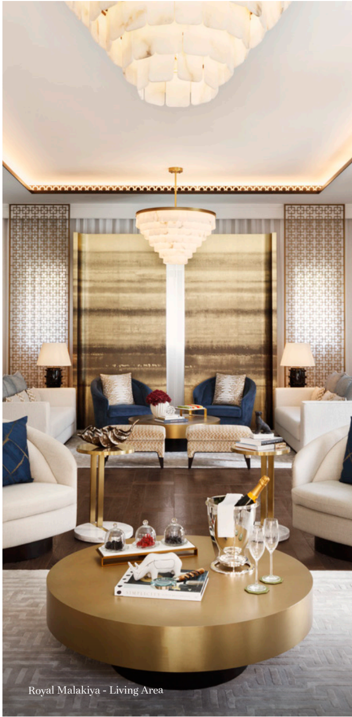
Royal Malakiya - Living Area