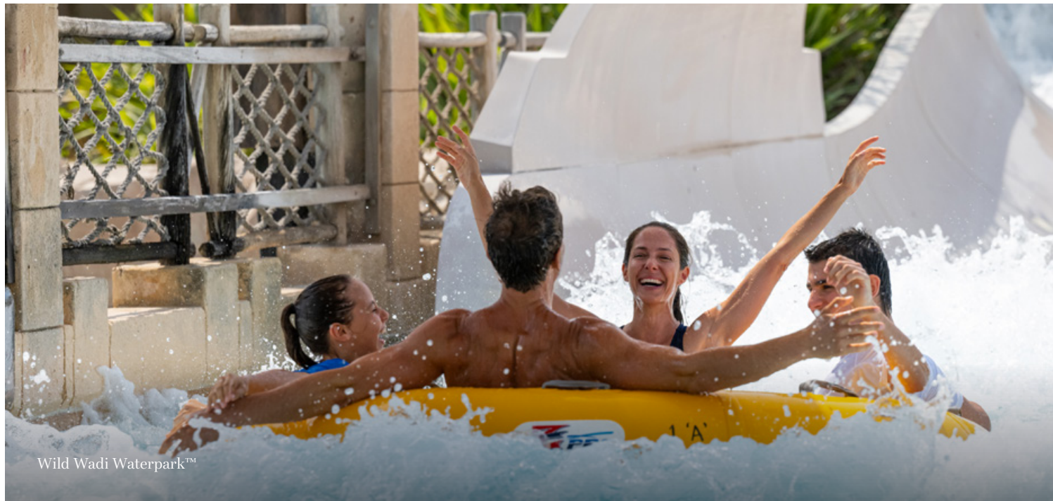
Wild Wadi Waterpark™