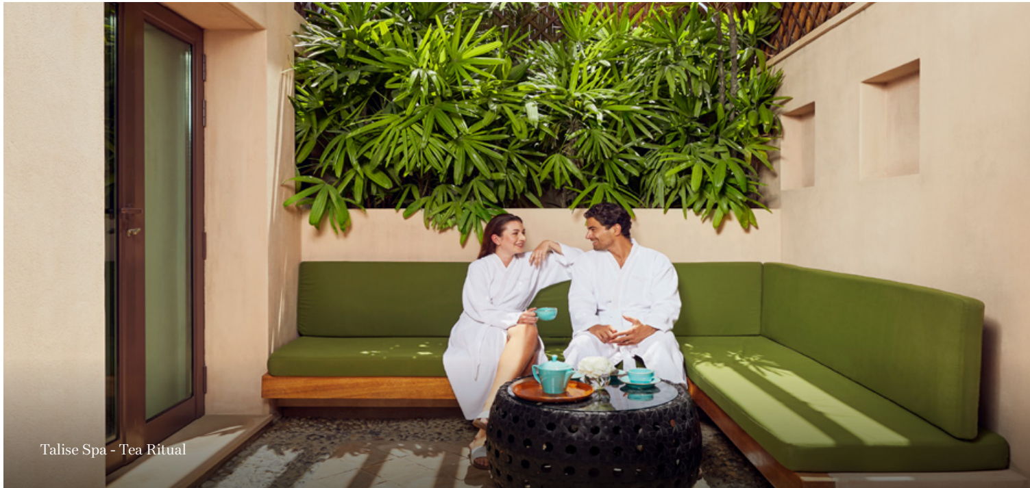
Talise Spa - Tea Ritual