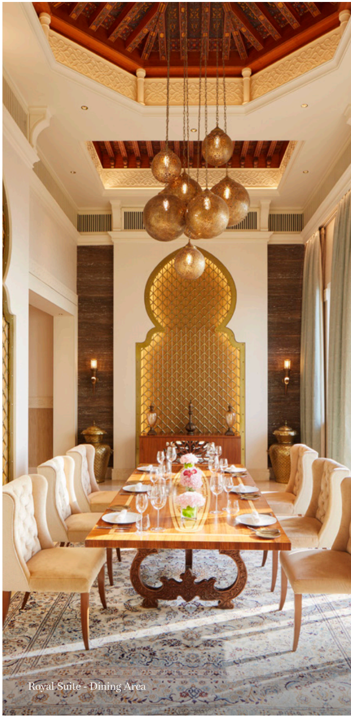
Royal Suite - Dining Area