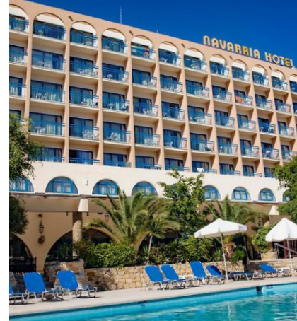
▲ Navaria Blue Hotel Verginas 14, Limassol 4532, Cyprus