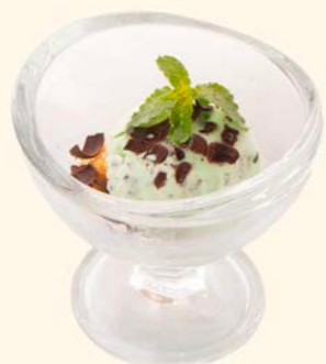
Ice-Cream (per scoop)