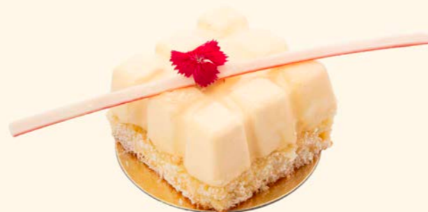
Phu Quoc Coconut Rhum Mousse