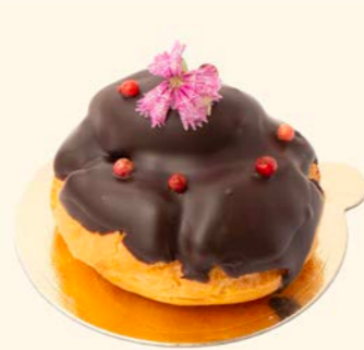
Phu Quoc Peppercorn Profiterole