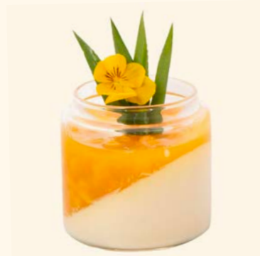
Mango Panna Cotta