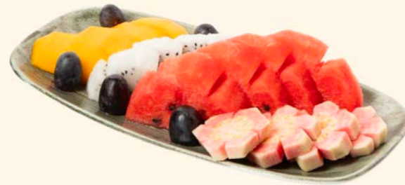
Tropical Fruits Slices