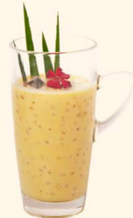
Mango Sago Che