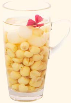
Lotus Seed Che