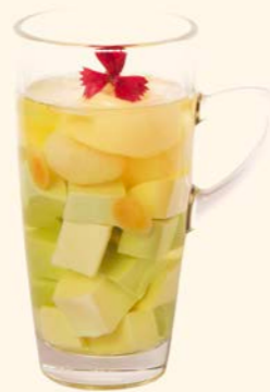
Milk Jellies Che & Custard Flan